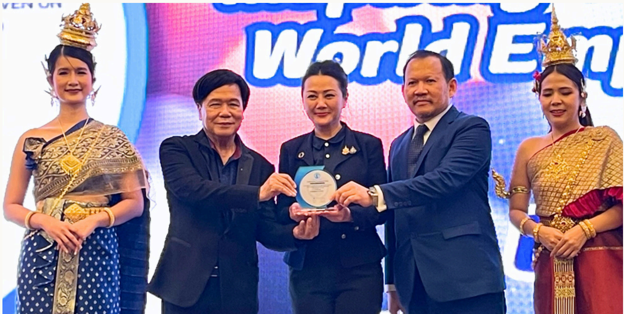
Discovery: The Legacy for the Creation of Heaven on Earth, inspiring the New World Sustainable Empowerment future.

Sustainability is not a policy — it is a way of life rooted in respect, balance, and empathy. Be the change you wish to see in this world by transforming “I” into “We.” Together, we plant the Seed of Life that grows into the Tree of Life, blossoms into the Flower of Life, and bears the Fruit of Life — where peace, prosperity, and wellbeing flourish as Heaven on Earth. Leadership begins within; by nurturing consciousness, compassion, and courage, the next generation will design a civilization guided by purpose and love.